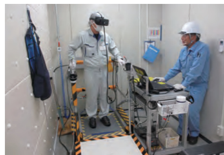
VR experiential education

Since many of the occupational accidents that have occurred are recurrences of past cases (similar accidents), the center has prepared a program to help workers see that potential accidents are always present, and to improve worker understandings of danger and their sensitivity to hazards through simulated experiences of past occupational accidents. In addition, we have implemented a new educational curriculum that utilizes VR technology, enabling students to have hands-on experience as a victim of an accident or disaster, a situation not easily simulated in real life. In recent years, while the number of occupational accidents among employees has been decreasing, the number of occupational accidents among employees from Subcontractors has become an issue. To address this, we have introduced midsize education facilities at our core operating sites to improve the sensitivity to hazards and safety awareness of not only our Group employees but also those of our Subcontractors. The Safety Education Center and the midsize education facilities work in unison to eradicate occupational accidents among workers.