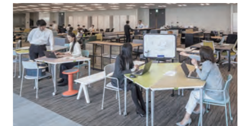
Layout configuration that encourages meetings and work in open, non-confined, spaces