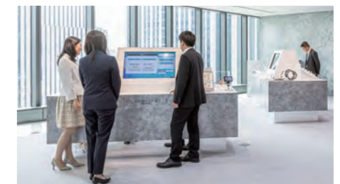
Establishment of a showroom with hands-on exhibits that enable an intuitive understanding of technical characteristics, etc.