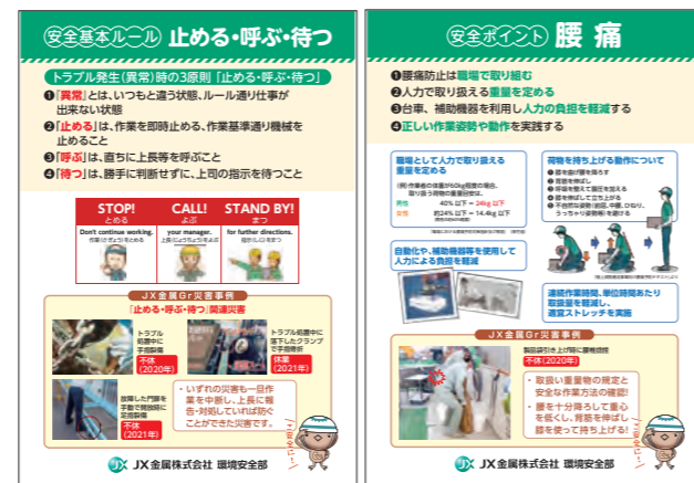
Actual safety awareness posters in use

The Group strives to ensure the safety and health of all persons connected to our business, and to elevate safety-first awareness and sensitivity to hazards. We strive to raise safety awareness and prevent recurrence of accidents by producing safety educational materials such as disaster reproduction videos, based on actual accidents and disasters, and safety awareness posters, based on actual accidents that have occurred within and outside the Group.